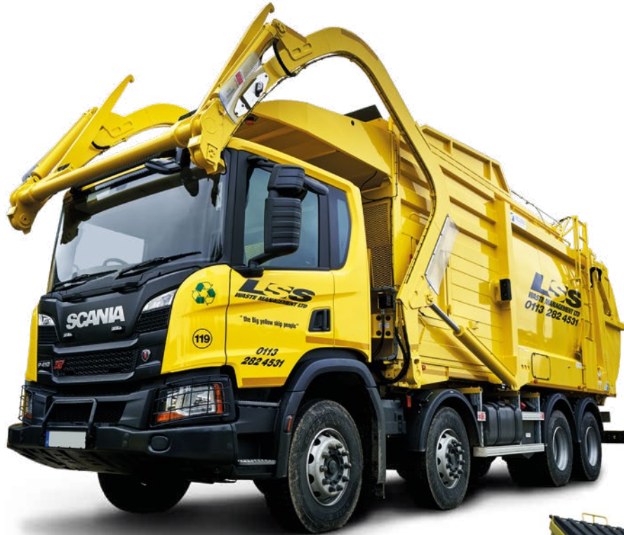
8YD 3 FEL bin with lockable lid

Our fleet of Front-end Loaders (FELs) is ideal for compactable waste such as paper, cardboard, plastic and general office waste.