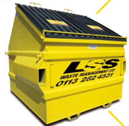
Easily moved with a forklift

The FEL bin service also includes all waste documentation management , complete with a full audit trail.